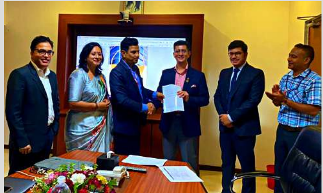
HR Diagnosis with National Life Insurance

“ KFA Consulting has provided consulting services to more than 100s of corporates in Nepal. ”