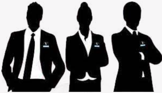
Exhibit the skills that "new normal" hospitality is looking for!

Since providing exceptional service and making customers smile are the main goals of the industry, there are a core set of skills that you'll need to possess.