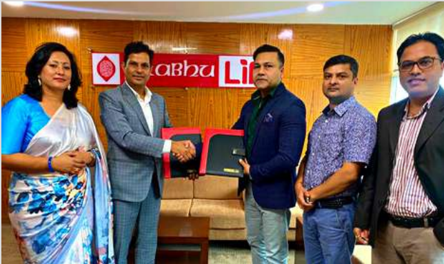
Successfully signed HR Diagnosis with Prabhu Life Insurance