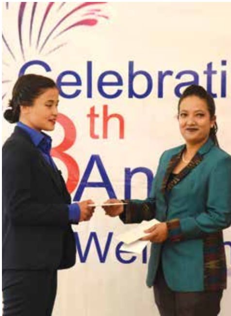
Scholarship being awarded to a student on Anniversary of the College