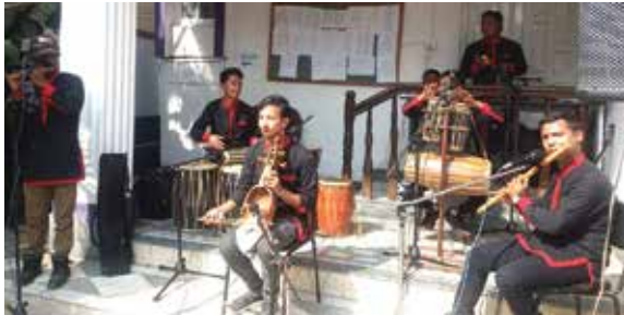
Students performing in College Event