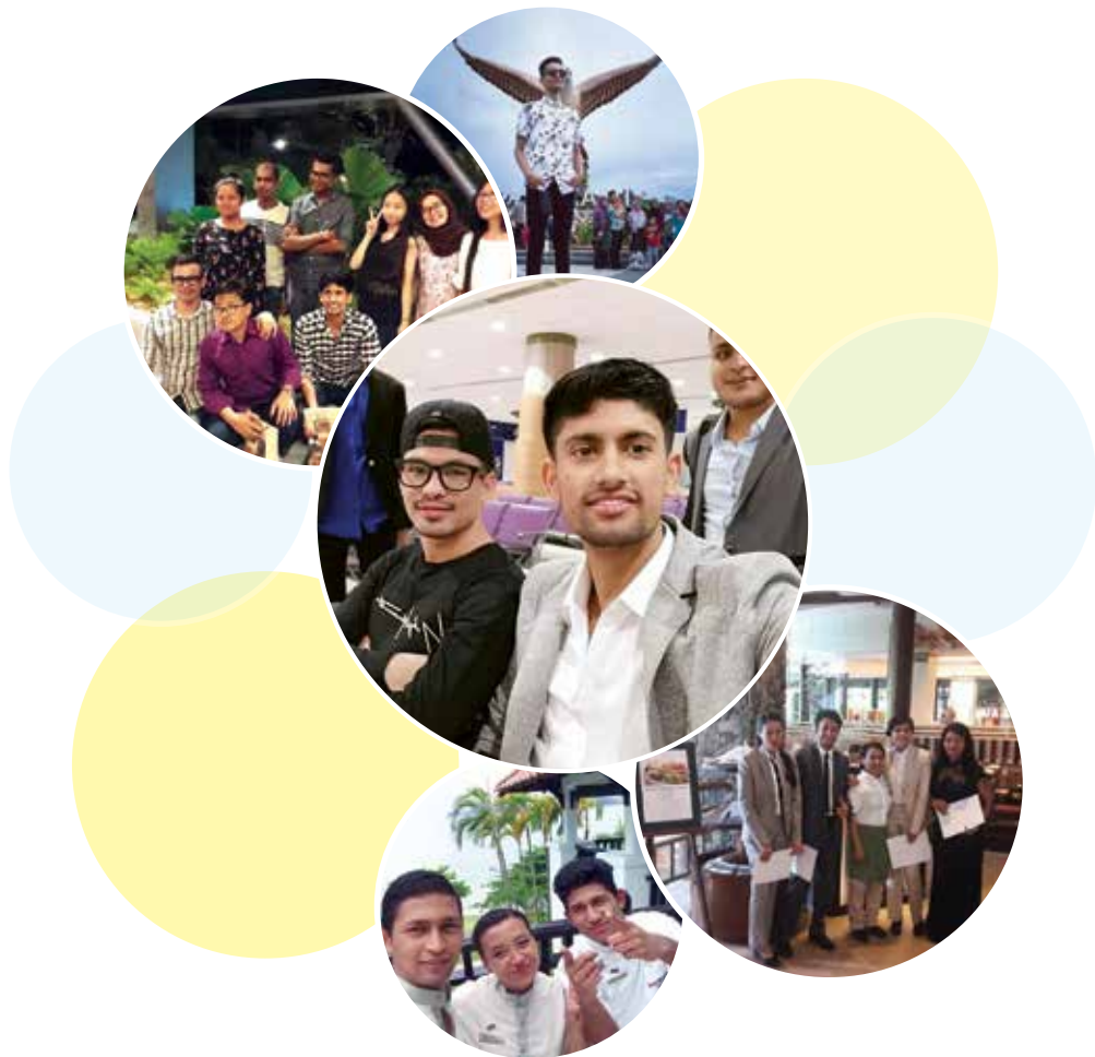
Students during their Internships in Malaysia