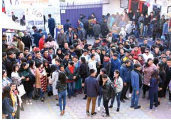
Guests enjoying the college's annual event "MOMOs & More"