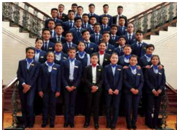
Students at Atrium of Hotel Yak & Yeti during Hotel Visit