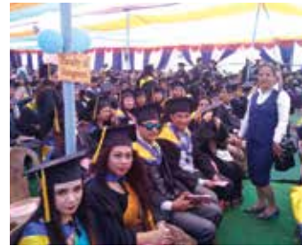
Students with Principal attending the Convocation