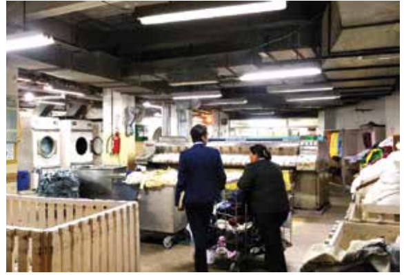
Students observing and learning about Hotel Laundry Operations