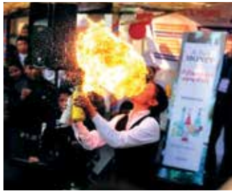
Student performing Flairing in Annual College Program