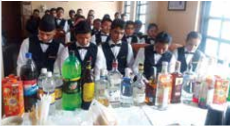
Cocktails training session