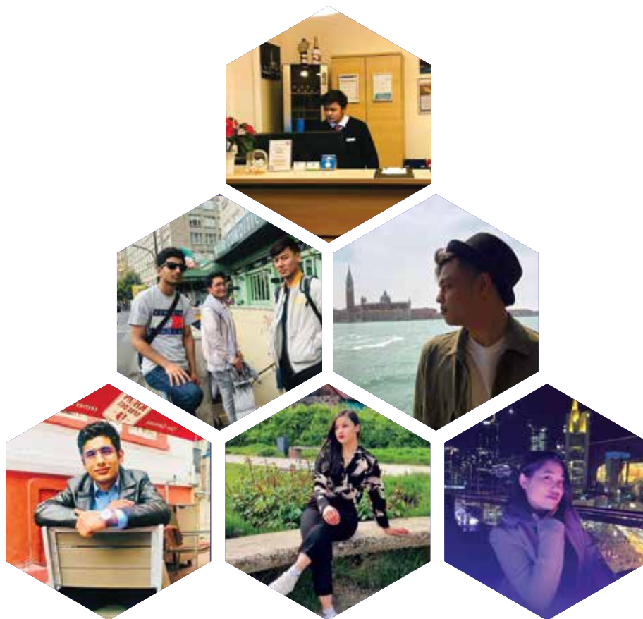
Students during their internship in Germany