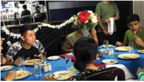
Students enjoying food.