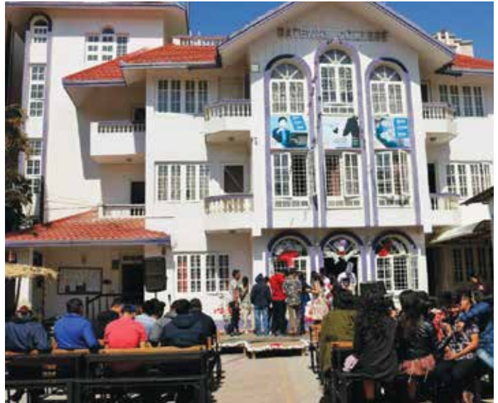
Students getting ready for the game during their practical