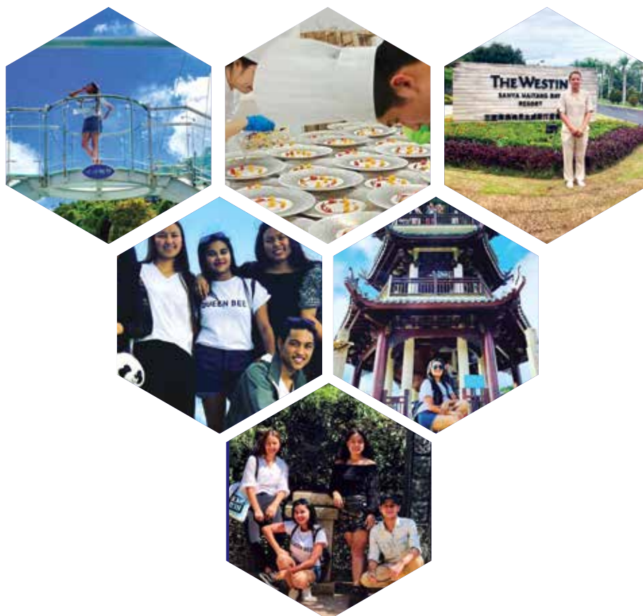
Students during their Internships in China