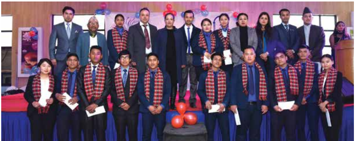
Scholarship Winners with The Principal and Faculties during 9 th Anniversary Celebration of the College

I would say that it was an excellent experience to study BHM in Gateway. In my opinion, it has very experienced teachers from the hotel industry, administration is very friendly and cooperative. The college management and the team helped me to believe in myself, groomed me, developed my skills and made me capable to further perform well in the hotel industry. I would like to thank my teachers and of course the management for providing such a quality education, which is now making my life easier and helping me to achieve my career goal.