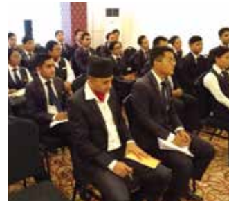
Students participating in Seminar organized by College