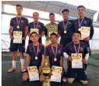
Students after winning the Trophy in PATA Futsal Tournament