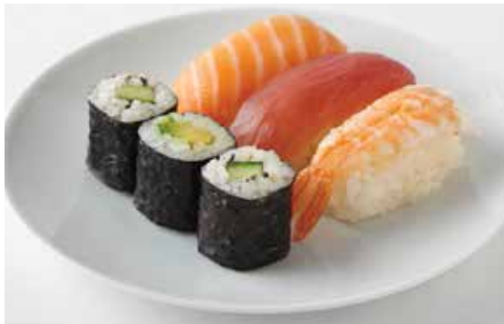
Creations of Gateway Students during their Practical Sessions