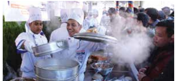
Students cooking Mo:Mo: in "MOMOs & More" event