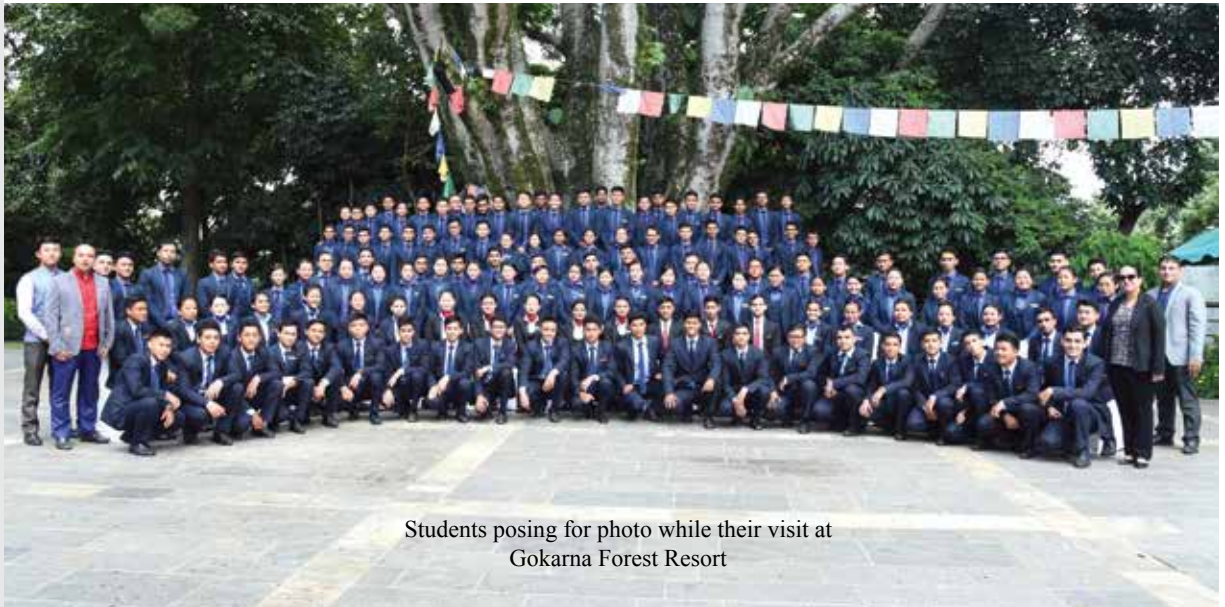
Students posing for photo while their visit at Gokarna Forest Resort