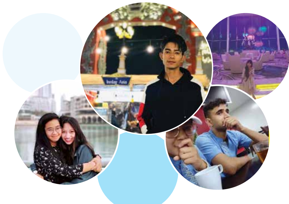
Students during their Internships in Middle East