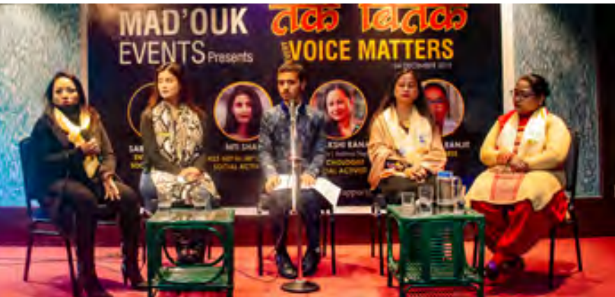
TarkaBitarka: A panel discussion on Acid Attack, an event organized by a Mad'ouk group at National College