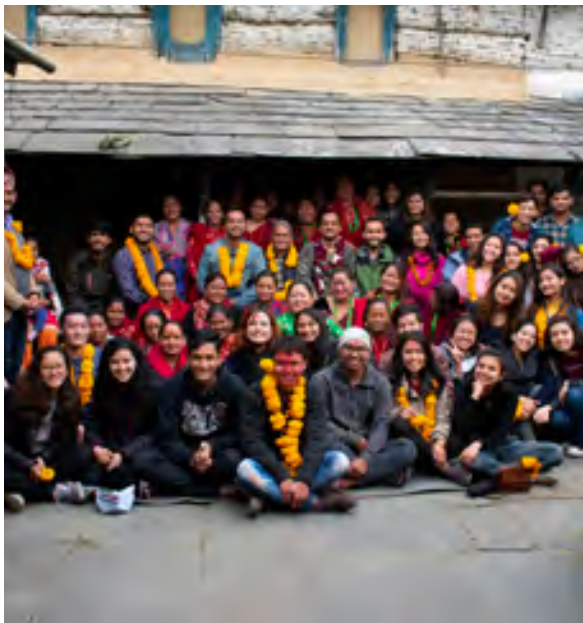
Field visit study at Machhapuchhre Village Council, Pokhara among members of microfinance

Financial Literacy Training for the young school students