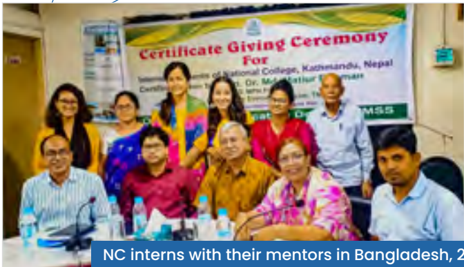
NC interns with their mentors in Bangladesh, 2019