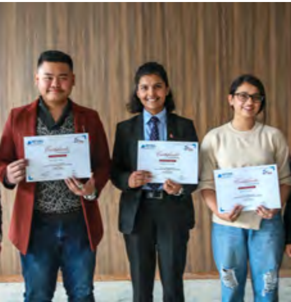
Winners of the 2nd edition of All Nepal Poem competition.