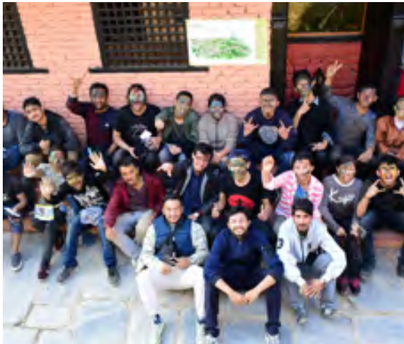
Next Gen Youth Fellowship Batch 2017 during field visit in Bandipur