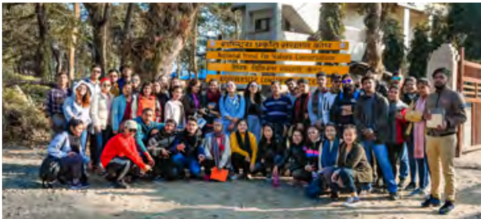
Students during the field visit in National Trust for Nature Conservation, Chitwan

Financial Literacy Training for the young school students