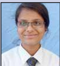
Akchhita Mittal Science Batch 2074

Starting from a splendid building so centrally located yet serene, next to a pond, the College has everything students desire including a graceful study atmosphere. KIST is a golden key that opens the door to our future success: personally, academically, and socially. You'll blossom into a real doer, and topper.