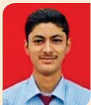
Sijal Raymajhi Scholarship, IOE