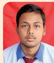
Balram Sah Scholarship, PU