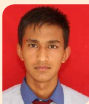
John Poudel Scholarship, IOE