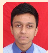
Saroj Kumar Pokhrel Scholarship, IOE