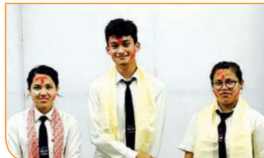
TU Toppers First Semester